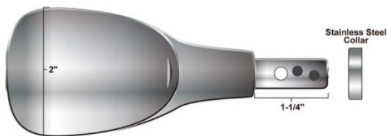
Diagram A - Parts and Assembly

Note: If turning very hard woods or plastics, use 1/2"mm drill bit to drill the hole.