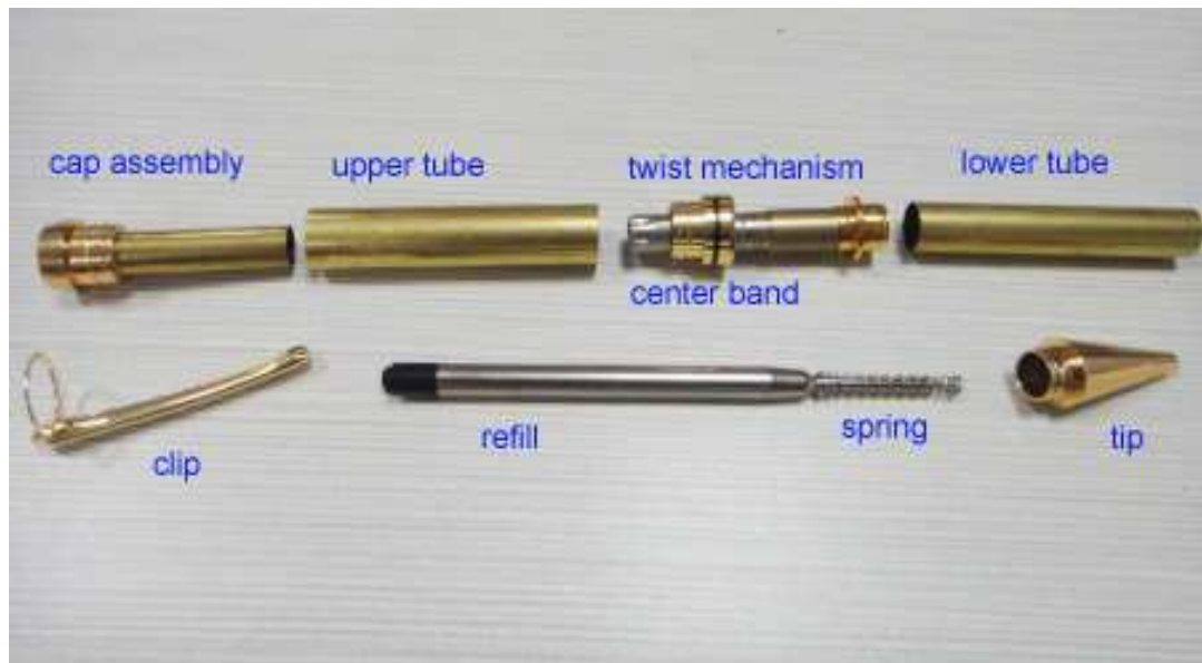
DIAGRAM A -- Assembly