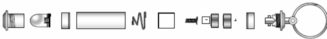
Diagram A / Parts Layout