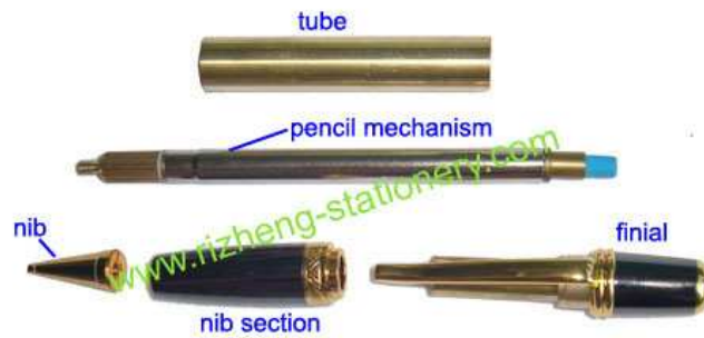
RZ-40#PCL-GGM Gold sierra pencil